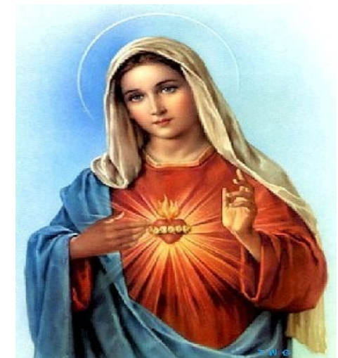
Immaculate Heart of Mary pray for us.